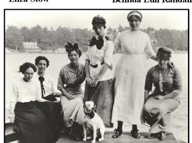
Young women at Lake Boon