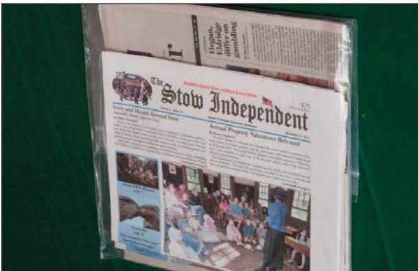
Time capsule contents included documents and artifacts ranging from newspapers to a skein of alpaca yarn from Springbrook Farm.