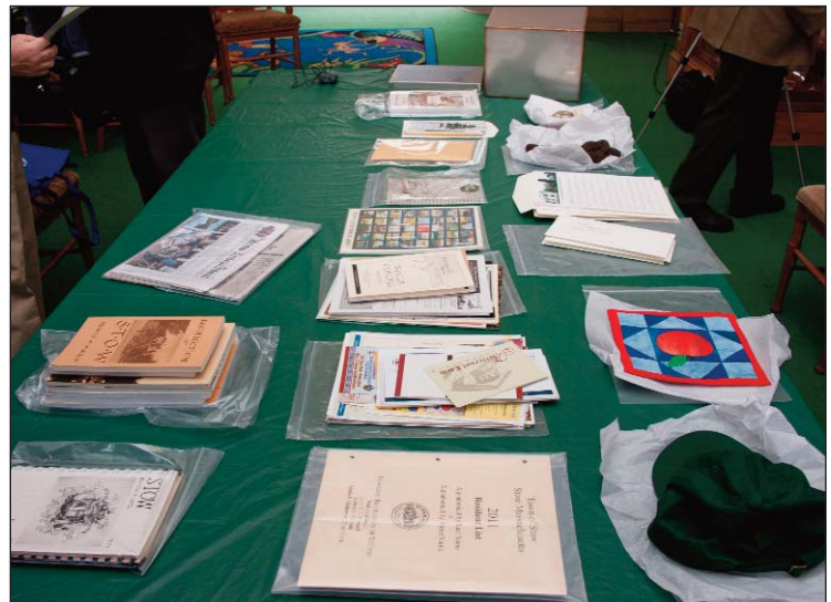
Sealing event photos by Dwight Sipler