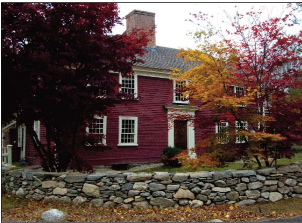
The Randall-Hale House on Sudbury Road dates to the early 1700s but was remodeled in the 1760s into a superb Georgian-style home. It's one of five homes in Stow on the National Register of Historic Places. Sorry, we won't be stopping and going inside it or any other buildings.

There's still time to join the Stow History Bus Tour on Saturday afternoon, May 19th. SpringFest may not be an official Stow event this year, but the Stow Historical Society is one of several organizations doing "SpringFest" events – in our case, a Stow history tour that takes us back to our community's evolution from farm town (in 1900, 1,000 cows and 1,000 people) to the golf and apple Mecca we live in today.