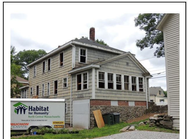
Habitat volunteers renovate a two family former mill worker house

Light refreshments provided! We welcome donations towards our local builds at the end of the evening.